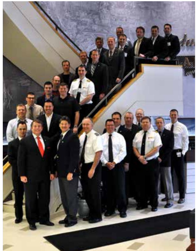
Aviation Security Group and Jumpseat Council Leadership, March 2014